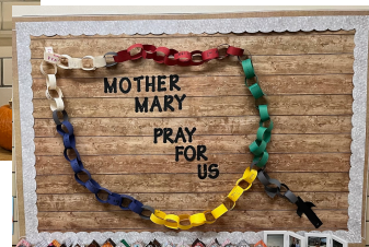
Fall Bulletin Boards - Looking Good!