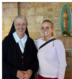
7th Grade Vocations Retreat